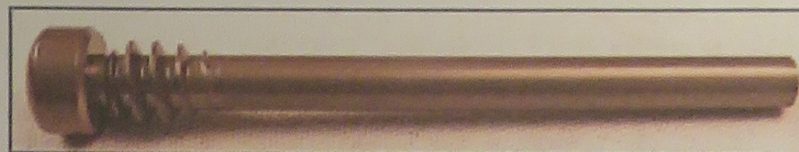
Close up of ISKD screw

These 4 screws are inserted into the bone, and located through holes in the ISKD